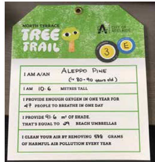
City of Adelaide, SA, interpretive tree trail sign using i-Tree data.

Innovators - creating interactive tree maps, educational programs and interpretive tree walks