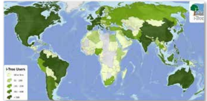
i-Tree user map based on software downloads and tool use

i-Tree Database is a web portal used to submit data needed for cities to be integrated into i-Tree.