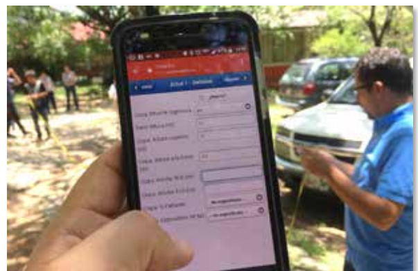
Eco mobile data collection - Spanish language version.